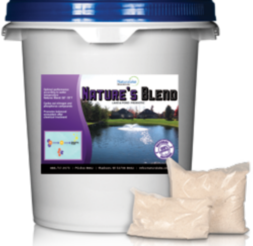
Nature's Blend is available in 10 and 30 pound containers.